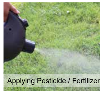
Applying Pesticide / Fertilizer