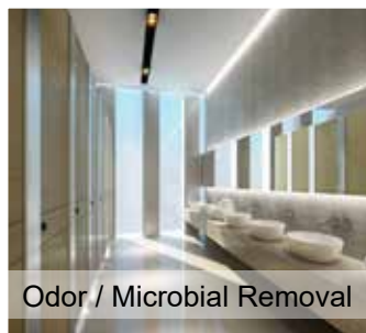
Odor / Microbial Removal